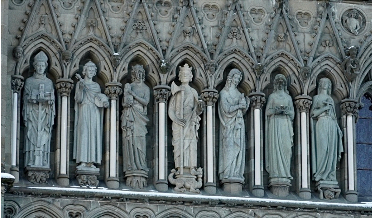
There are dozens of statues on the facade, but I zoom in on St Olav, wielding his trusty Viking battle-axe!