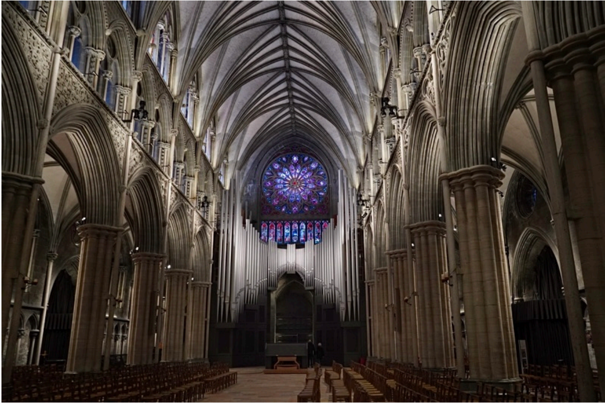
This view looks back to the rear with the pipe organ and the stained glass rose window.