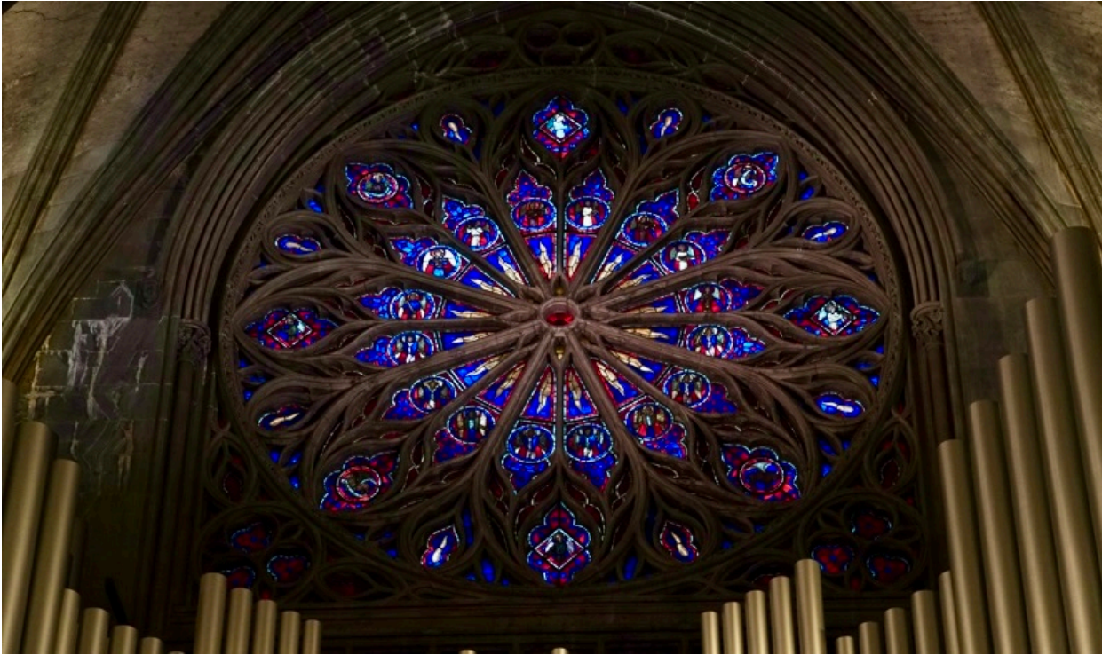
Close-up of the rose window