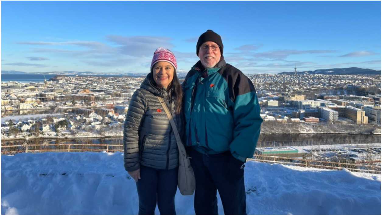
Yes, it's cold, but we came prepared. But it's still cold!