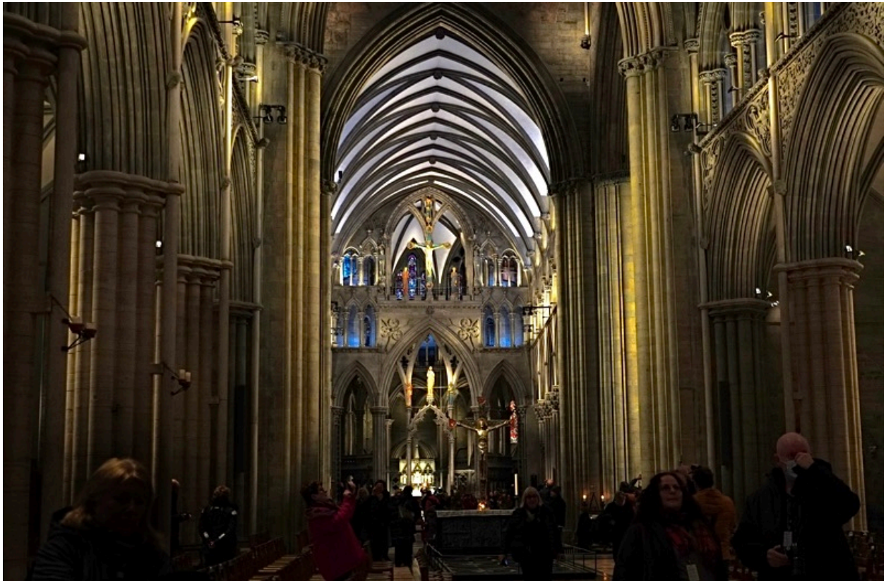
Inside, it's magnificent! The scale is on a par with any of the great cathedrals of Europe. This view looks forward to the altar.