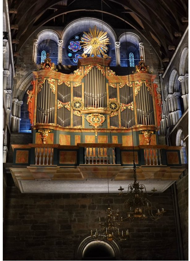
The organ on the left is modern, from 1960; but there's another one on the right from 1740.