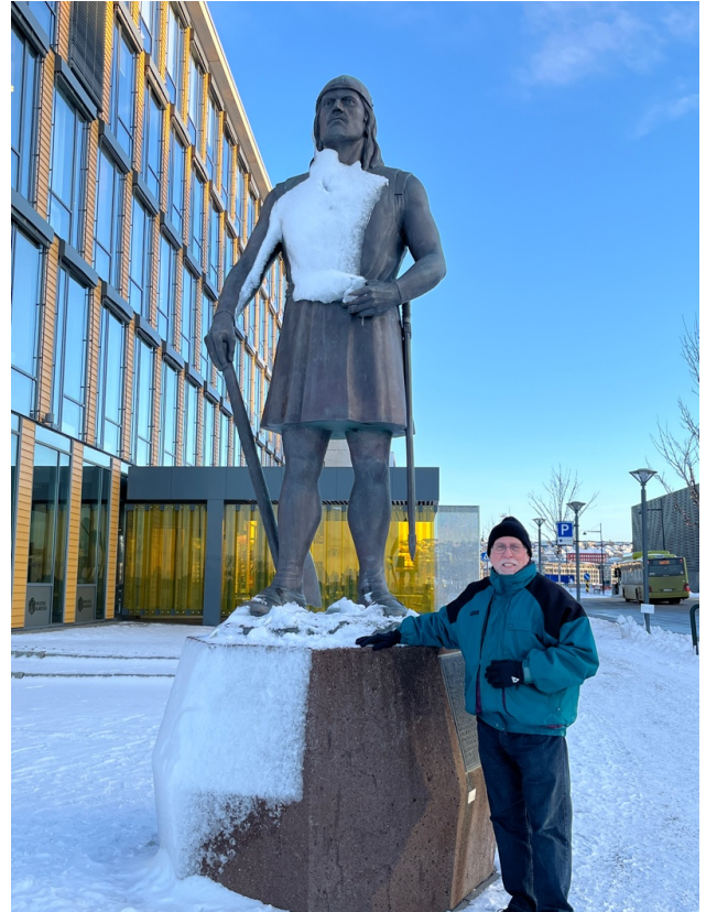
Back at the pier, a monument to Leif Erikson, the “real” discoverer of America. Reportedly he sailed from Trondheim, but who knows? And actually he found Newfoundland, so who cares? And if you're thinking he looks cold... you'd be right.... and so are we!