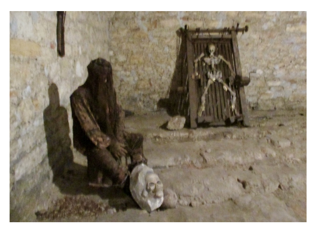
This is one of our "special" VIP Guest Rooms!