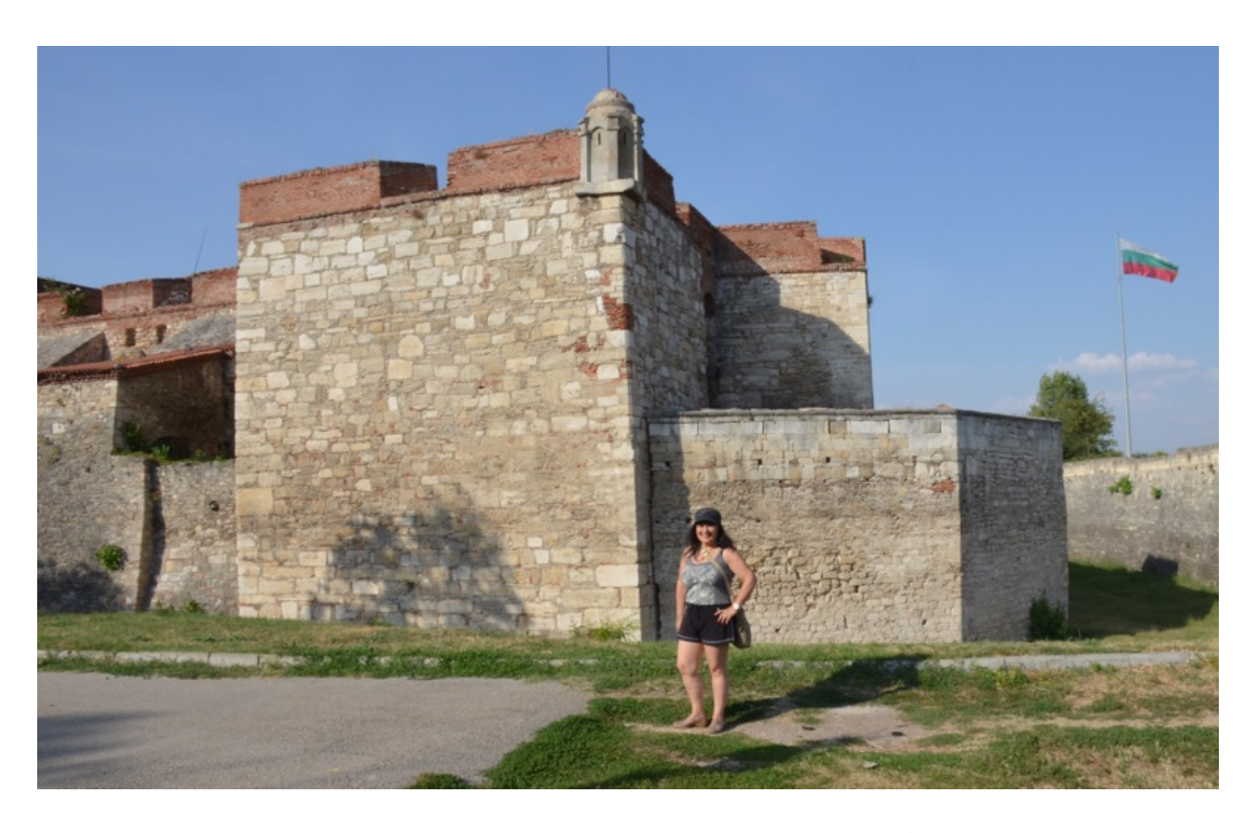
A highly strategic location between rival Empires, the fortress did change hands many times over the centuries, depending who was in charge of the country—be it Romans, Bulgarians, Hungarians, Ottomans.