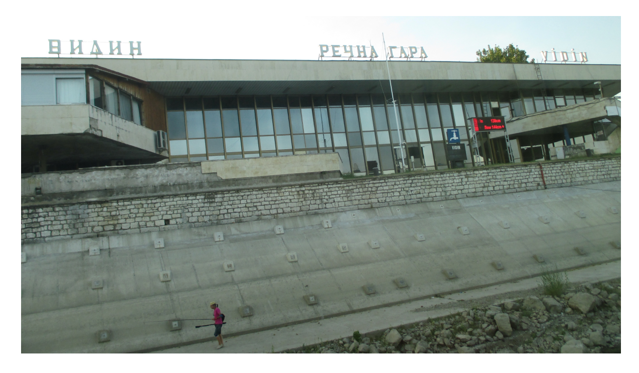
Today we dock in Vidin, Bulgaria. As you can see, they still use the Cyrillic alphabet here.