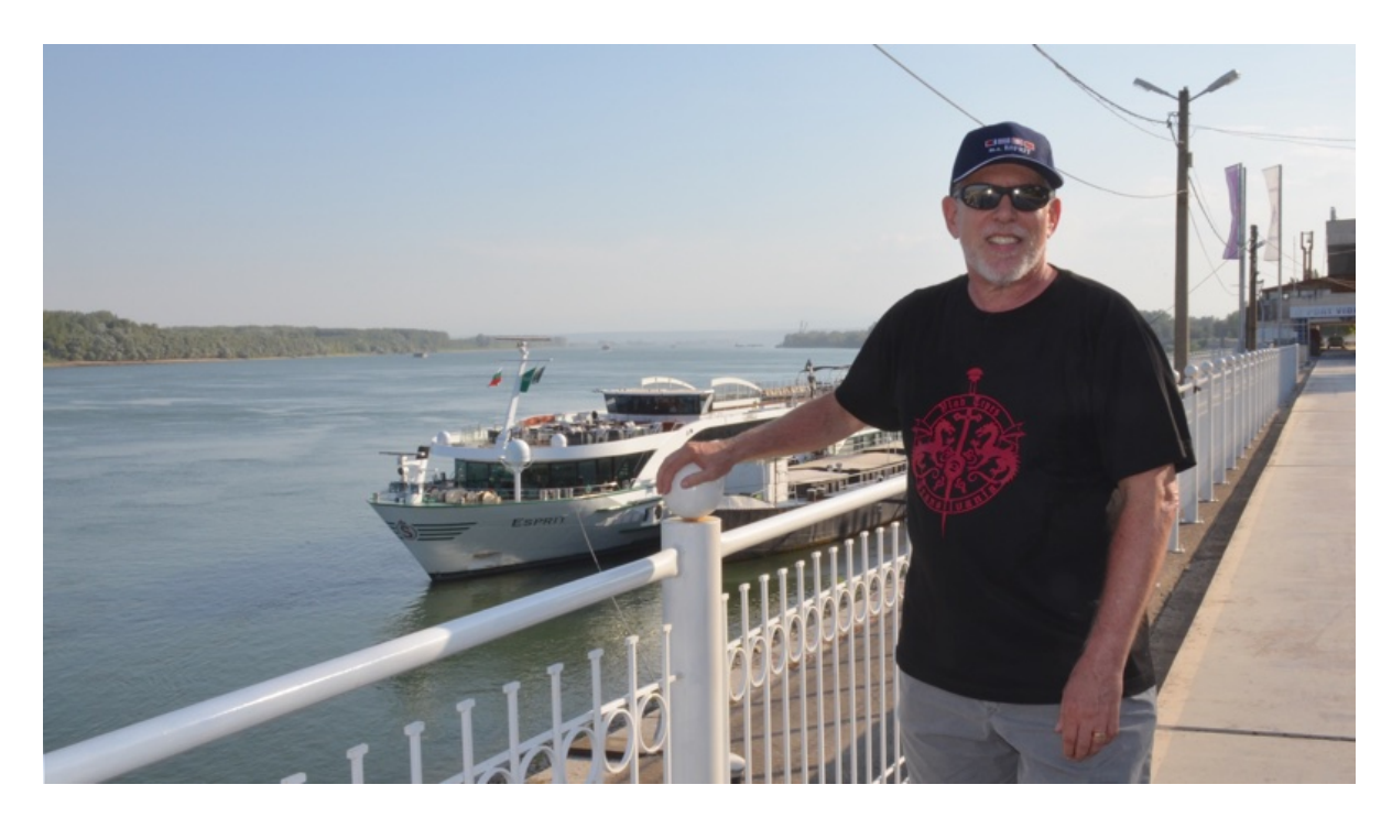
But now it's time to return to the present day and back to the riverboat.