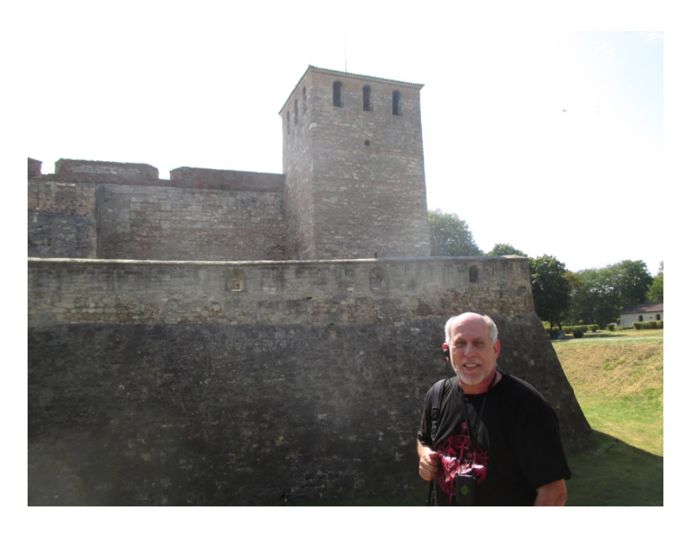
Hmmm.... I wonder if there's a way to get up there....