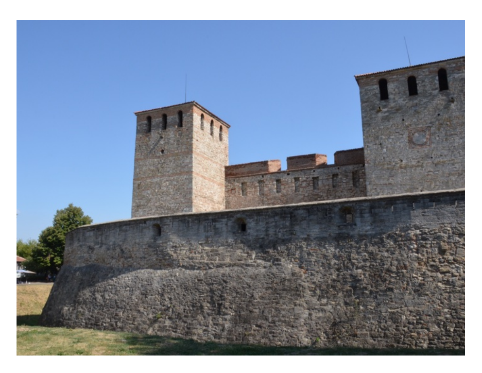
With walls up to 20 feet thick, reportedly the fortress was never breached. It was only defeated once, by a prolonged siege.