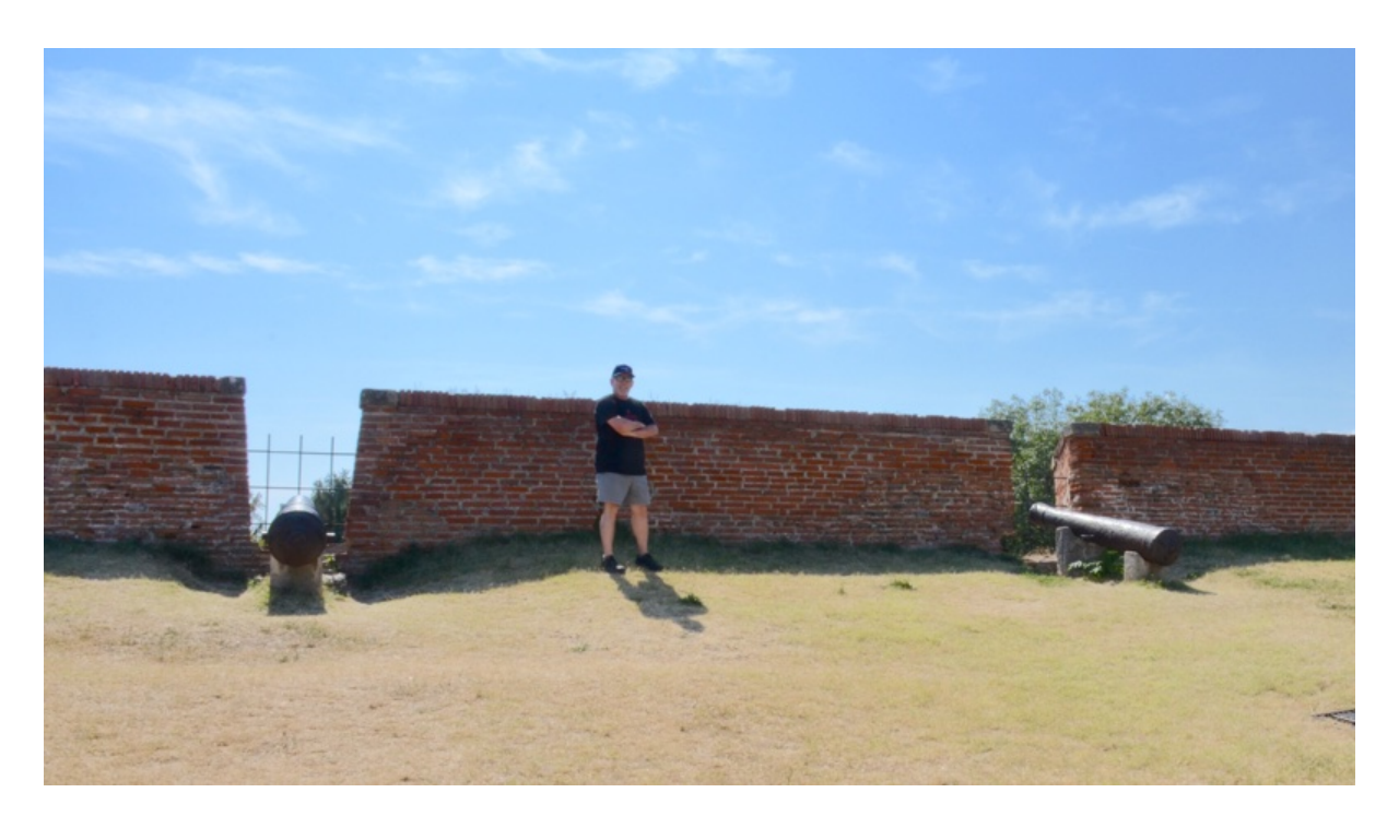
Betcha my cannons are bigger than yours!