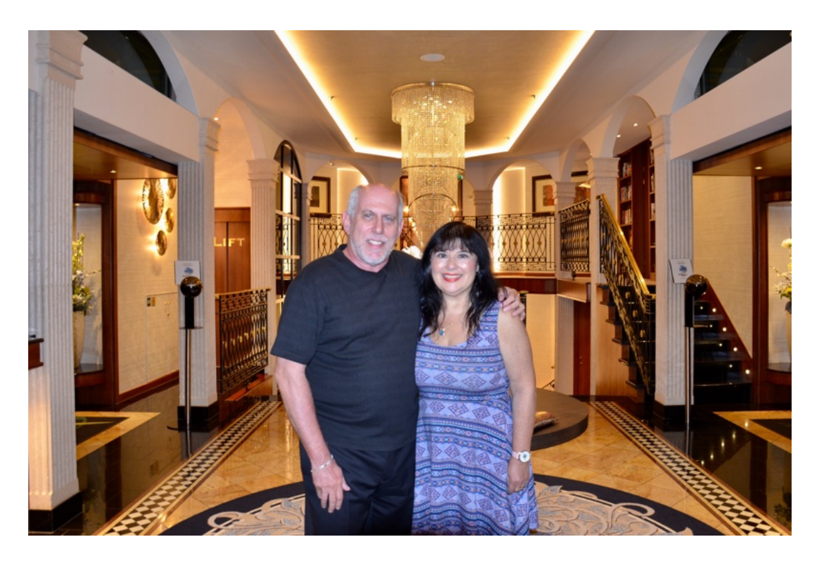
We wash off the dust of the ages and continue our never-ending quest to: Live For Vacay!