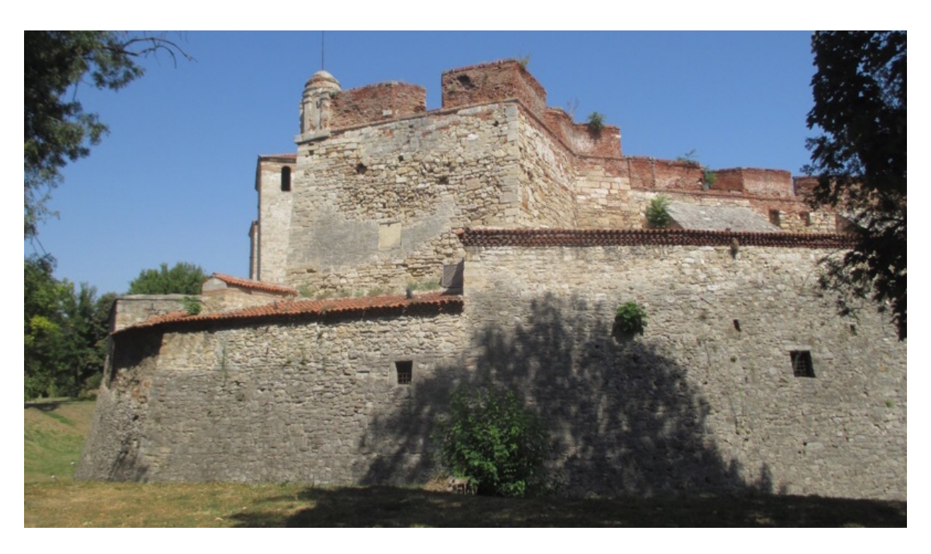
The fortress is incredibly well preserved. The original structure dates from the 12th - 13th centuries, and was expanded over the years.