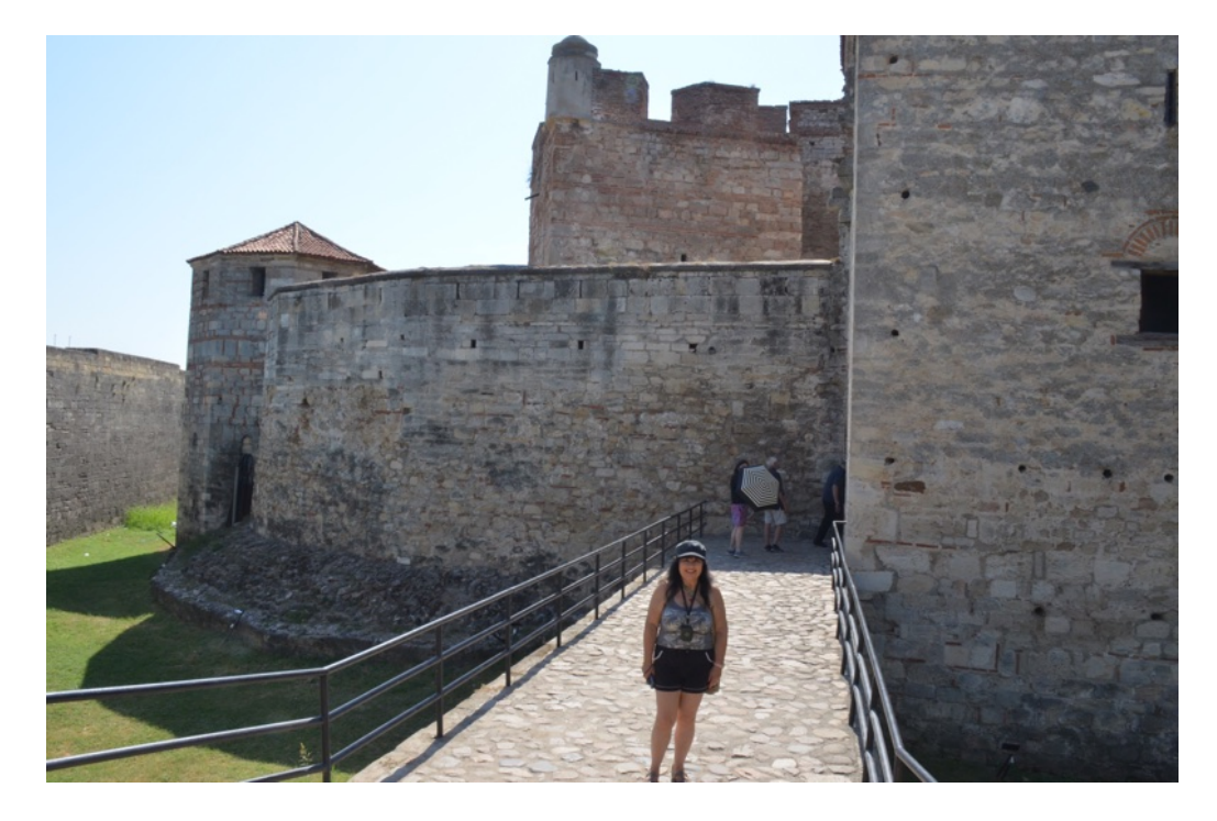
In olden times there would have been a wooden drawbridge; now it's stone.