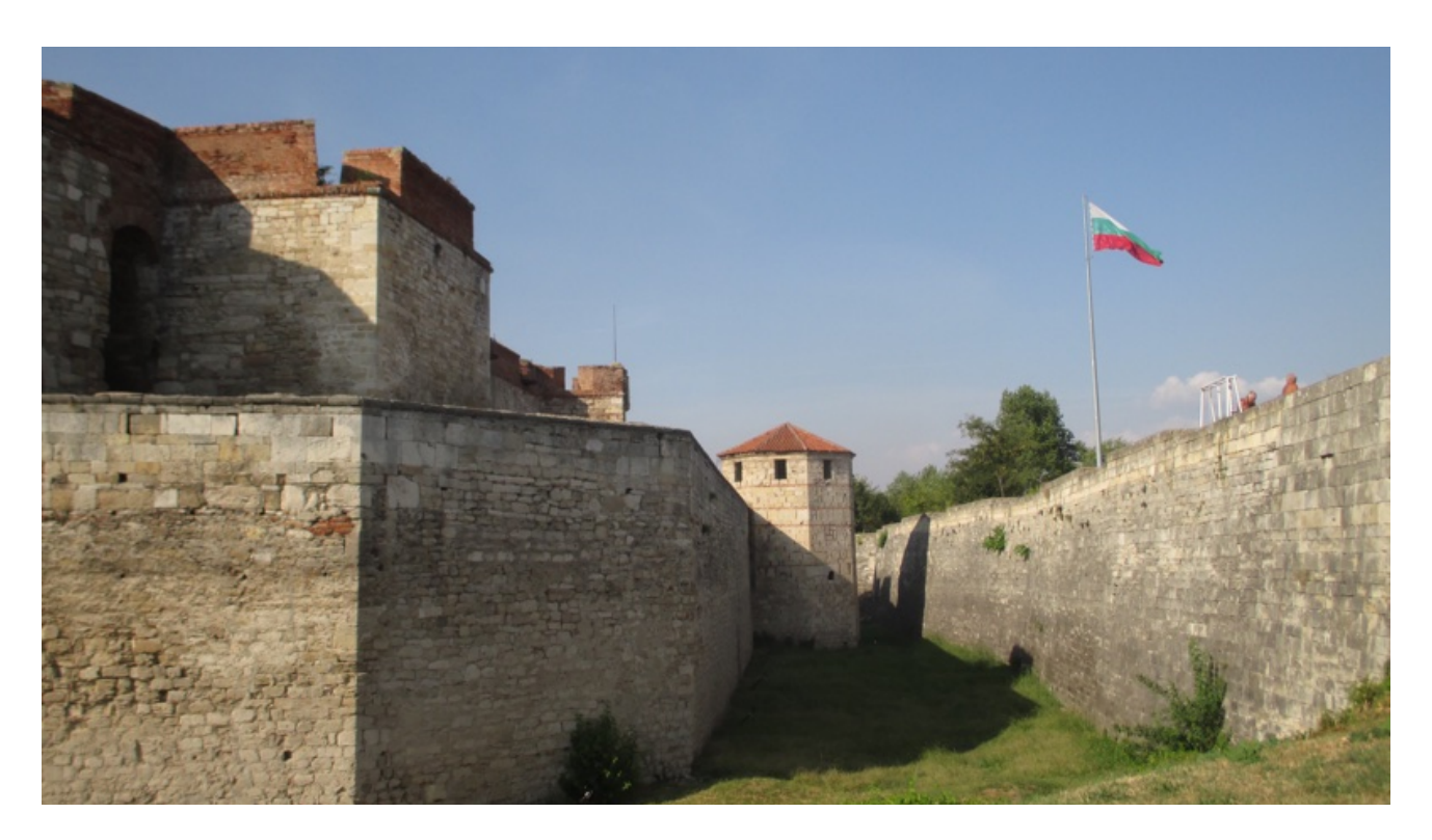
It was surrounded by a moat (aren't all forts?) with water from the Danube, which runs just beyond the other side of that wall with the Bulgarian flag.