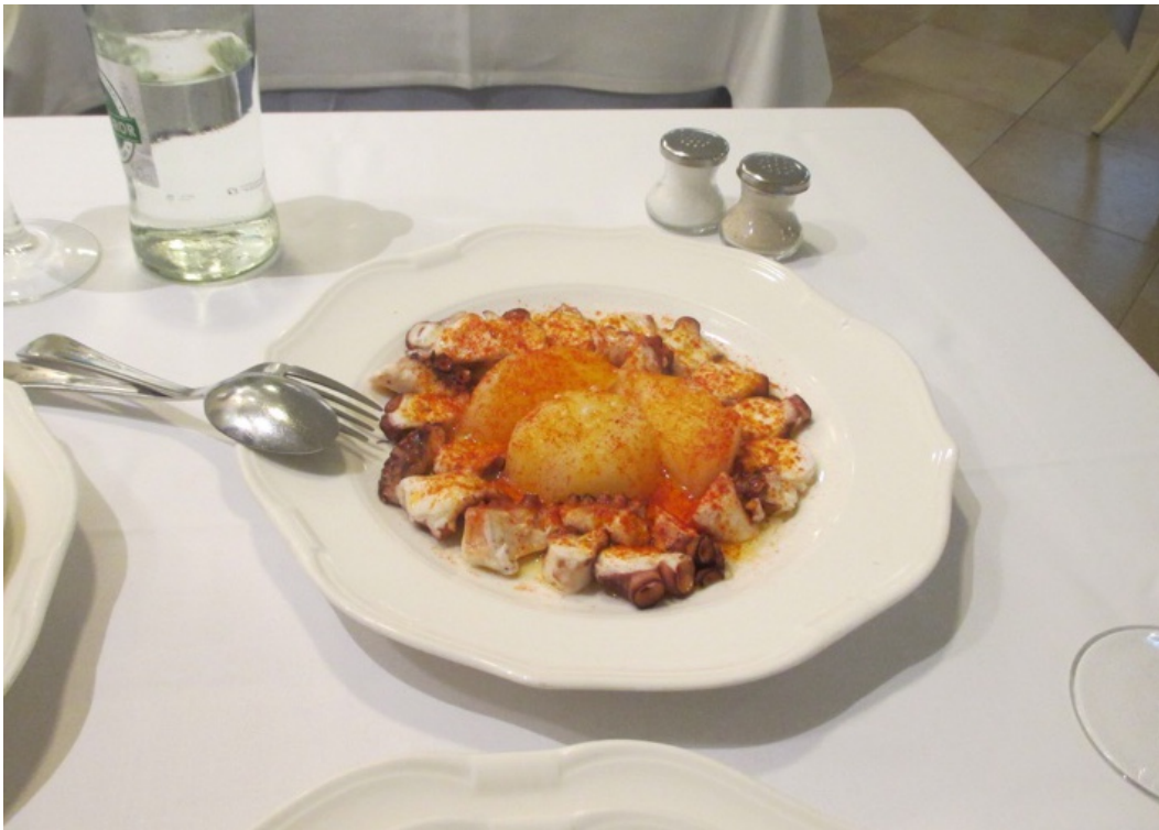
Appetizer: Octopus, Galician style, with paprika & olive oil (those are potatoes in the middle).