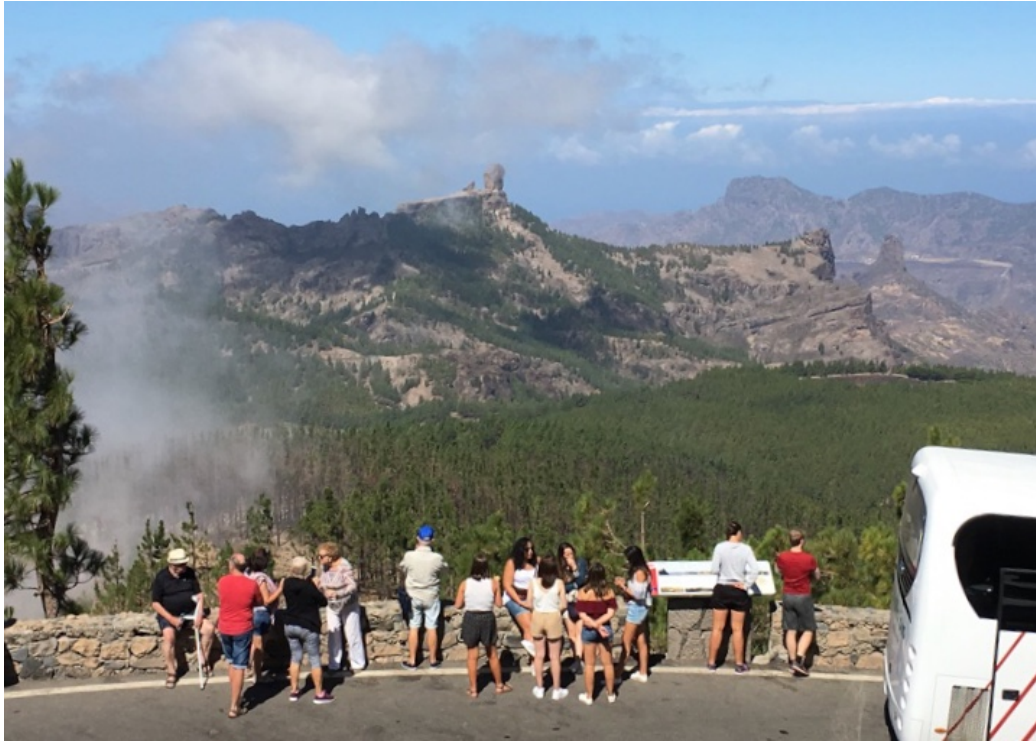
Fantastic views surround us as we continue into the mountains.