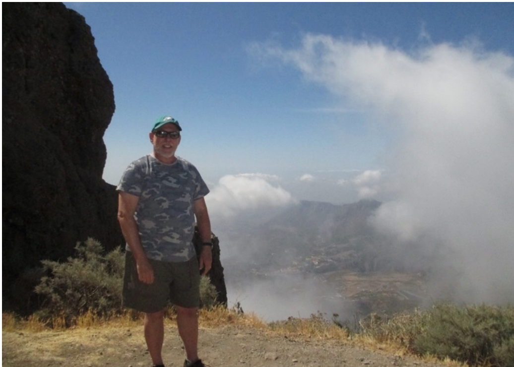
Up, up, up — 2000 meters, above the clouds!