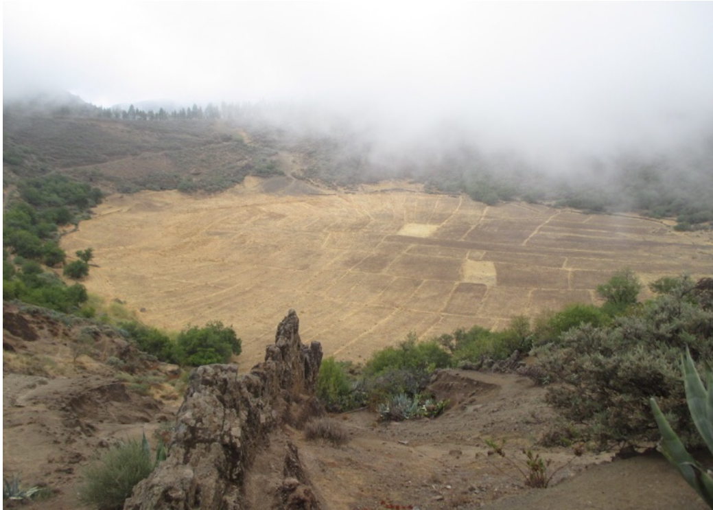
They took us up to the caldera of the ancient volcano at the center of the island. This is it. It was about 20 degrees cooler than at sea level and the clouds kept rolling past.