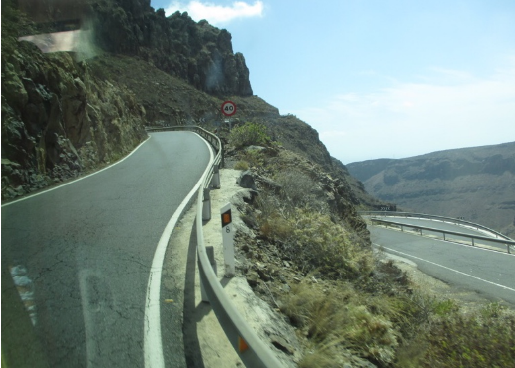
Having had our fill of the beach, today we are going on a full-day group bus tour of the island's rugged volcanic interior. Glad I'm not driving—look at this road!