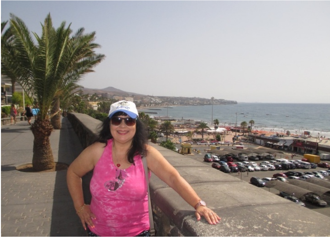
¡Vamos a la Playa!