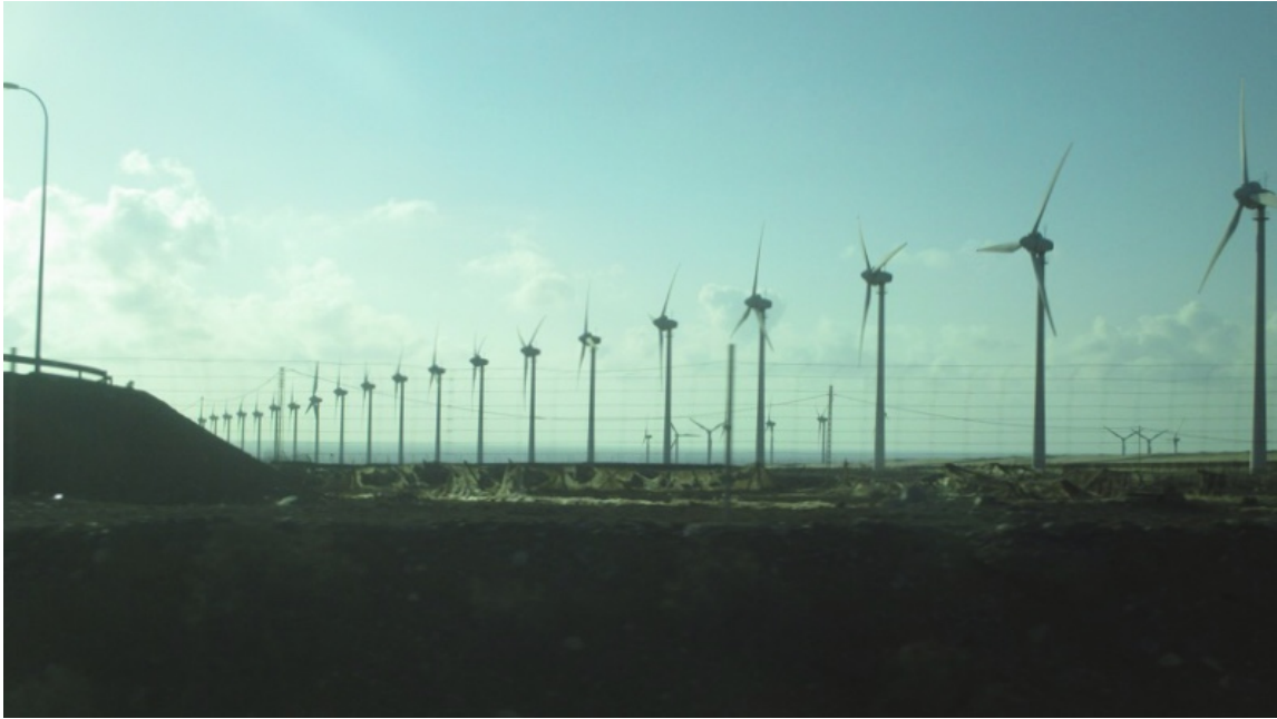
Arriving on Grand Canary Island, we are impressed by the large number of windmills.