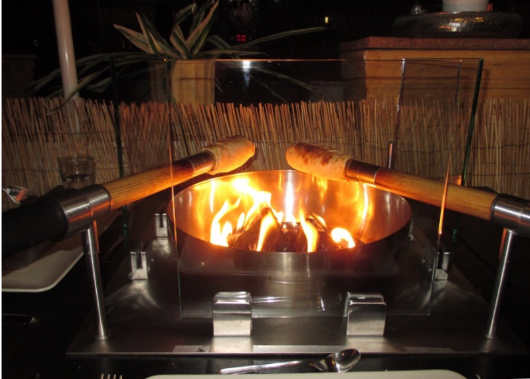
Another night, another restaurant I found on Trip Advisor: El Fuego, where you cook with fire!