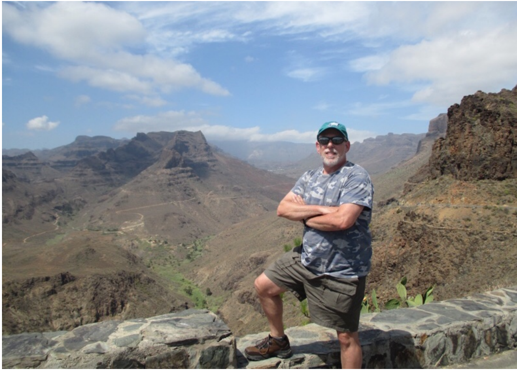
On top of the world!