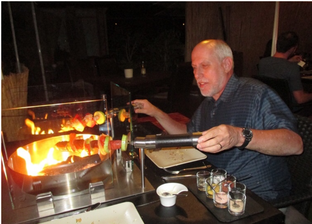
A German concept, each table has a gas flame pit. Judy had chorizo, I had shrimp. You get gourmet salts (yes, salts!) and dipping sauces. It was tasty, fresh, and fun! (Too bad, no discount for cooking your own food)