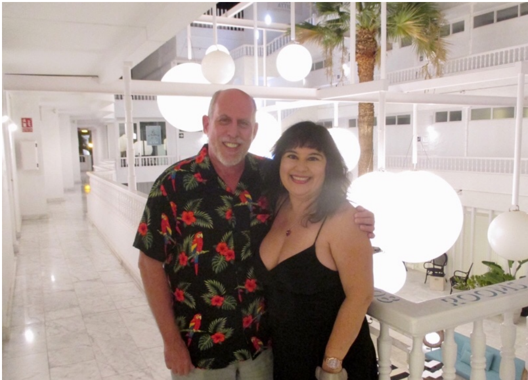
Back at the hotel, we clean up for a special dinner. It's our Wedding Anniversary—14 years! (PS—I would only wear this shirt in the tropics!)