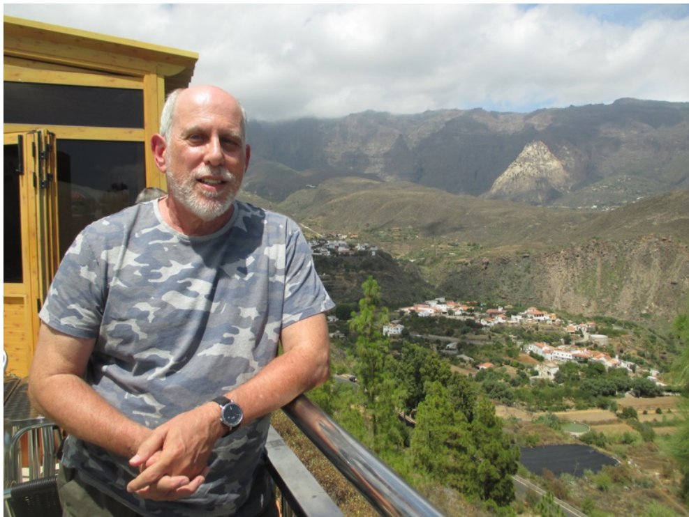
We had a little time to walk around that little village in the valley.