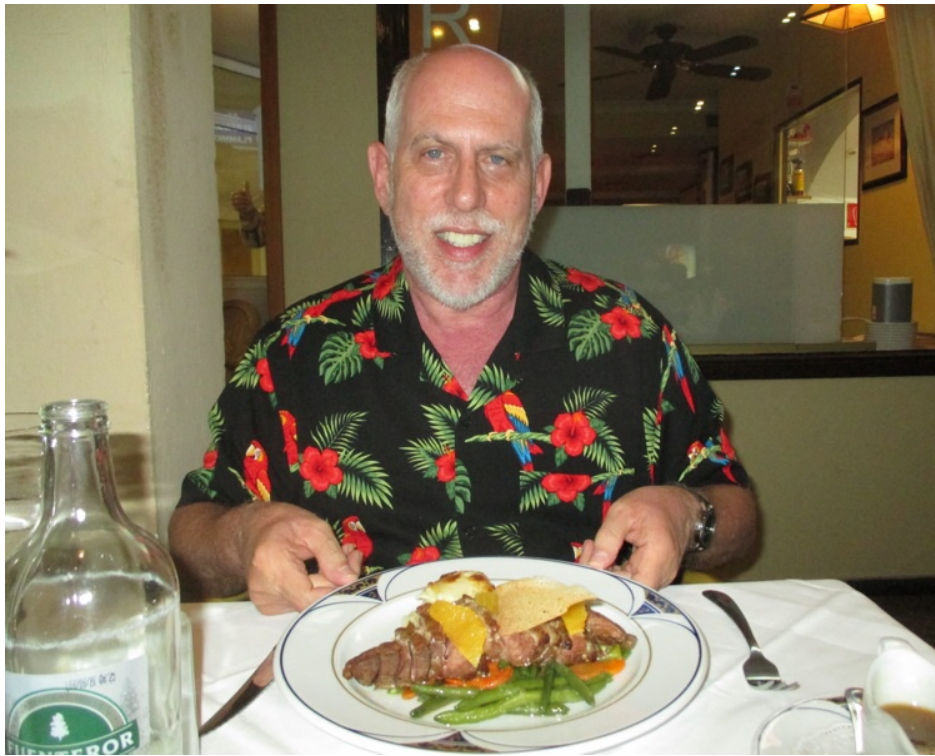
I had the duck à l'orange. It was perfectly cooked with crispy skin and pink center. Sweet! (also like our marriage)