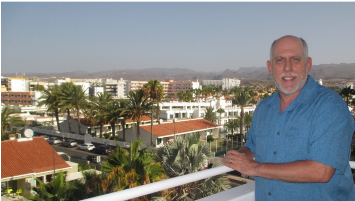
Morning view from our 6th floor hotel room. Check out the mountains! We'll head there in a few days, but first....