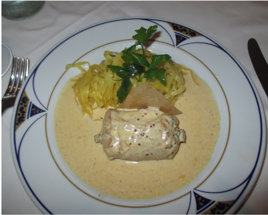
Judy had rabbit in a mustard cream sauce with fresh pasta. Spicy! (like our marriage)