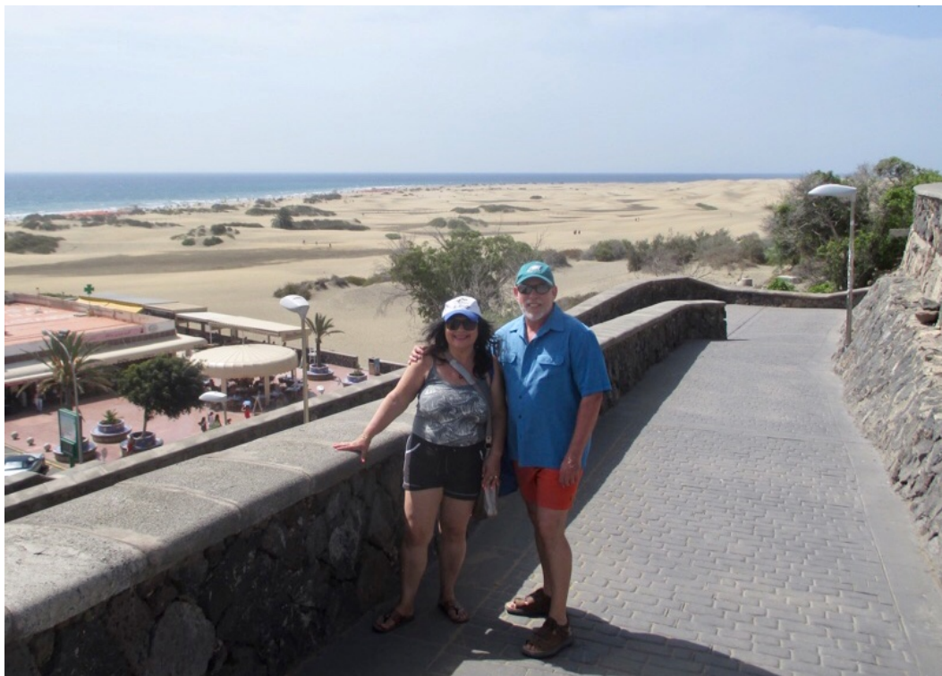
Behind us, the famous Maspalomas sand dunes. If you're up for it, you can take the long way to the beach and trudge through the dunes like a Bedouin.