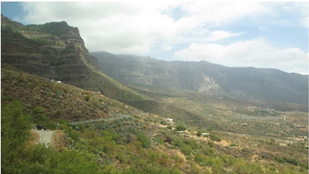
The “Grand Canyon” of Grand Canary