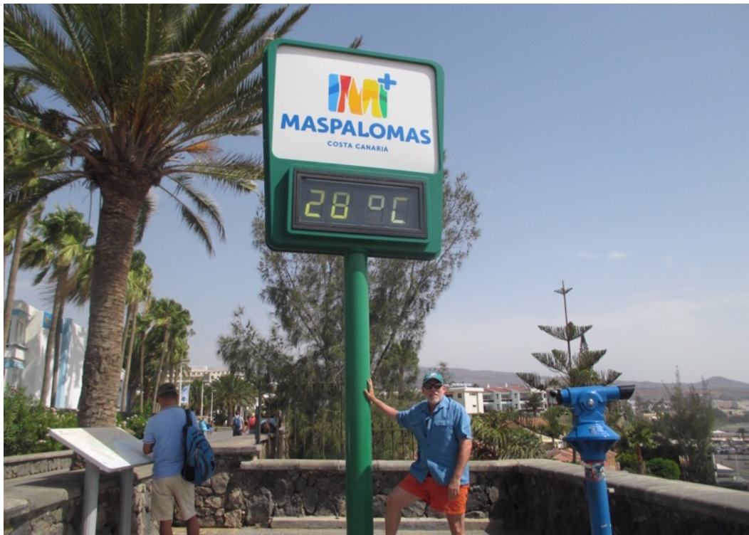
That's 84.5 degrees for you Fahrenheiters. No humidity, no bugs, and almost cloudless!