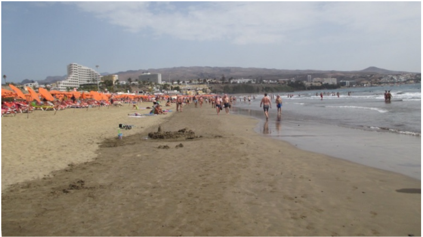
The Beach is very wide and stretches for miles, so you are never crowded. The water temp is not as warm as the Caribbean, but not nearly as cold as our local beaches.