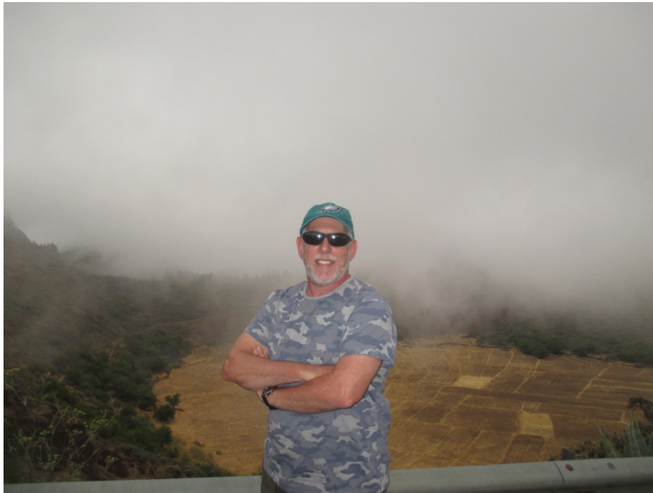
It was pretty awesome, but also a little bit unsettling to think that 5,000 years ago, this spot was a bubbling cauldron of lava that erupted and formed the island! (PS: so disappointing—I wore that cap for 2 days and not one person said “Go Eagles!”)